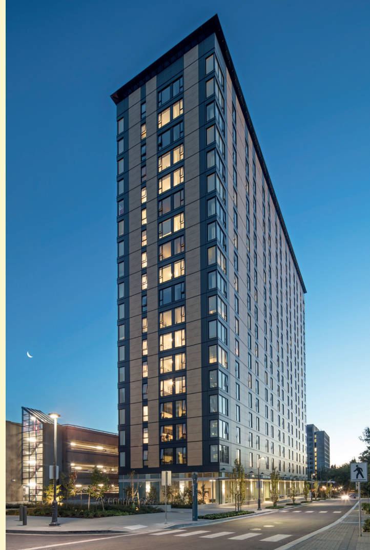
↑ Brock Commons Tallwood House is an 18-storey student residence at the Point Grey Campus of the University of British Columbia in Canada. At the time it was opened in 2017, it was the tallest mass timber structure in the world.

5 Increase training to upskill workers and create new jobs to boost the development of a sustainable and circular bioeconomy. New areas such as modern renovation and prefabrication require different skillsets and knowledge bases. Enhancing training and education is essential to a) create more sustainable, green jobs, b) develop the new skills in nature-based materials and c) improve the traditional manufacturing in wood industries.