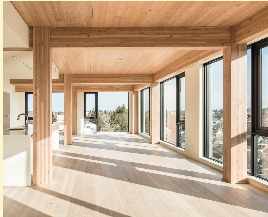
← Carbon 12, Portland, Oregon by Kaiser + Path This 85-foot-high mass timber condo provides residents with modern luxury, sustainable design and state-of-the-art technology. Constructed with sustainably harvested and certified CLT, when it was completed in 2018 it was one of the tallest buildings of its kind in North America, and the project is opening the doors to taller wood buildings throughout the state.

This growth has been encouraged by the commercial management of forests for timber and other forest products.